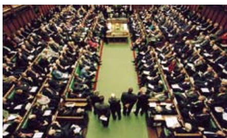
THE CHAMBER TODAY

To mix it up a bit further, there aren't two parties, there are several. At the moment the Labour Party (slightly left of the political centre) forms the government; the Conservatives (slightly right of centre) are the main