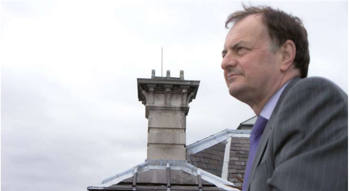
THE AUTHOR IN WHITEHALL

It's all played out in a gladiatorial arena that's too small for the total number of legislators (Winston Churchill had it rebuilt that way after World War II bombing destroyed it, because he loved the sense of theatre from a packed house). There's no assigned seating. The government party and their allies on one side, the opposition parties on the other. And the two sides are just over two sword lengths apart to keep them from killing each other.